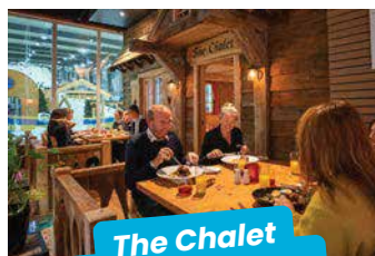
The Chalet Experience

The Chalet is a stand-alone swiss cottage offering unique group menus such as Après Ski with Swiss Fondue, 3D Dining and much more.