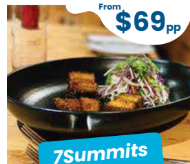
7Summits Buffet Menu

Enjoy a delicious 3 course meal with your choice of entrée, main and dessert to suit all tastes. Pre-orders required.