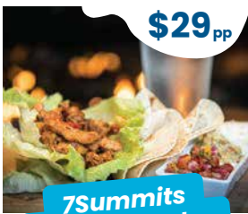
7Summits Light Lunch

Want a quick and yummy substantial meal? 7Summits Light Lunch is just the ticket! Choose from a delicious selection of main meal options.