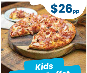
Kids Party Buffet

An elegant & stylish Restaurant & Bar, the perfect venue for group functions & events, with authentic schist walls, roaring log fire, and panoramic views of the slopes. Enjoy the unique Alpine atmosphere! The 7Summits Restaurant & Bar caters up to 200 people. Private dining in The Chalet offers an intimate and exclusive experience for groups of up to 24 people.