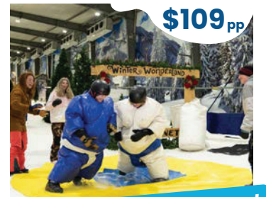
2 Hour Winter Wonderland Snow Games Combo

For Team Building with a difference or just a challenge with your mates - Snow Games is the most fun you can have on the snow!