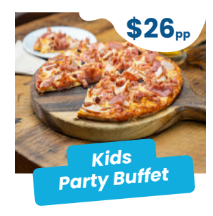
Traditional kids' buffet of party favourites sure to keep them happy and full. Suitable for ages 12yrs and under.

An elegant & stylish Restaurant & Bar, the perfect venue for group functions & events, with authentic schist walls, roaring log fire, and panoramic views of the slopes. Enjoy the unique Alpine atmosphere! The 7Summits Restaurant & Bar caters up to 200 people. Private dining in The Chalet offers an intimate and exclusive experience for groups of up to 24 people.