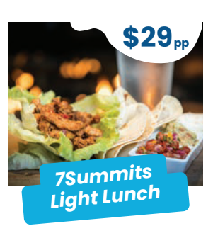
Want a quick and yummy substantial meal? 7Summits Light Lunch is just the ticket! Choose from a delicious selection of main meal options.