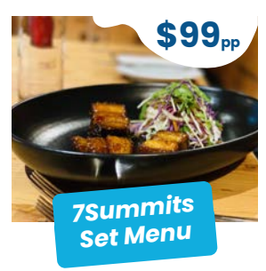
Enjoy a delicious 3 course meal with your choice of entrée, main and dessert to suit all tastes. Pre-orders required.

Minimum of 10 guests required Maximum 20 quests