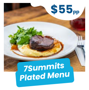
This delicious plated meal served with sharing dishes, delectable Dessert Trio and tea or coffee has something for everyone.