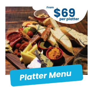
Light & tasty bites. With 7 scrumptious platters to choose from this is a great for sharing with your friends and colleagues.

An elegant & stylish Restaurant & Bar, the perfect venue for group functions & events, with authentic schist walls, roaring log fire, and panoramic views of the slopes. Enjoy the unique Alpine atmosphere! The 7Summits Restaurant & Bar caters up to 200 people. Private dining in The Chalet offers an intimate and exclusive experience for groups of up to 24 people.