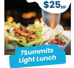
Want a quick and yummy substantial meal? 7Summits Light Lunch is just the ticket! Choose from a delicious selection of main meal options.