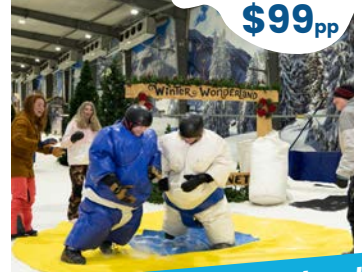
2 Hour Winter Wonderland Snow Games Combo

For Team Building with a difference or just a challenge with your mates - Snow Games is the most fun you can have on the snow!